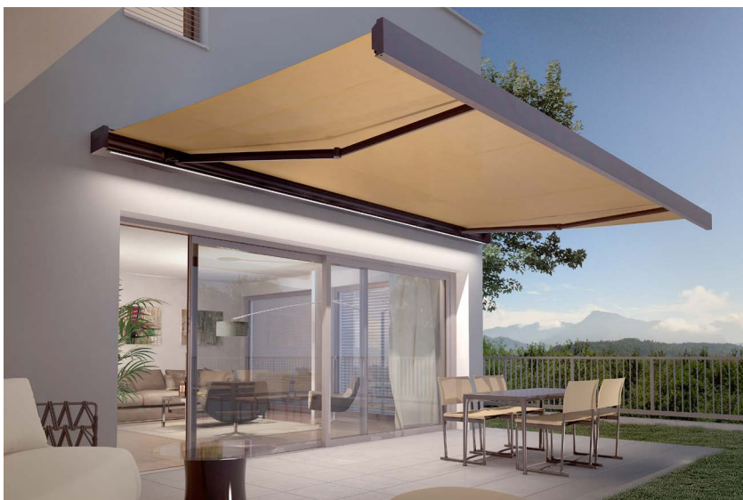
Fig. 1: Elegant, discreet and weather-proof cassette awnings installed on the façade provide shade for outdoor seating areas, terraces or balconies as needed.

The warnings of global warming are also an issue for manufacturers of sun protection systems such as awnings. They must ensure that the functionality and durability of their devices will fulfil the stricter requirements of the future. The plastic profiles, which are concealed in slide rails or roller mechanisms and ensure that the systems function smoothly in every sense of the word, also play a key role here. When it comes to upgrading your products, it is advisable to contact us as early as possible. Our experts can help you design future-proof materials and manufacturing processes.